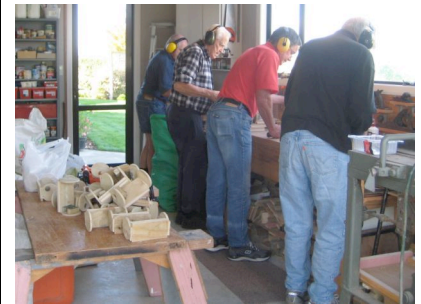
Bryan Jenkin, Ray Nicholson, Tony Rolley & Warwick Gatland on the production line